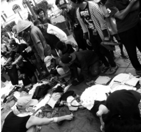
Really Really Free Market (RRFM) with other groups and individuals (September 2013).