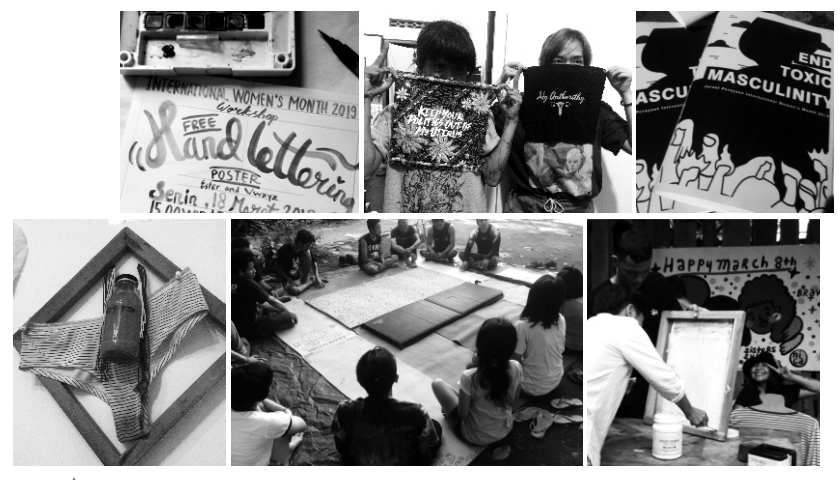
International Women's Month 2019 organized together with other collectives and individuals--mostly wmyn, for a whole month, campaigning "End Toxic Masculinity". We held workshops (self defense, reproductive health, zine making, natural remedies, eco print, etc.), talk with queers, discussions on sexuality. anarcha feminism, etc., film screening, exhibition, and music performance.