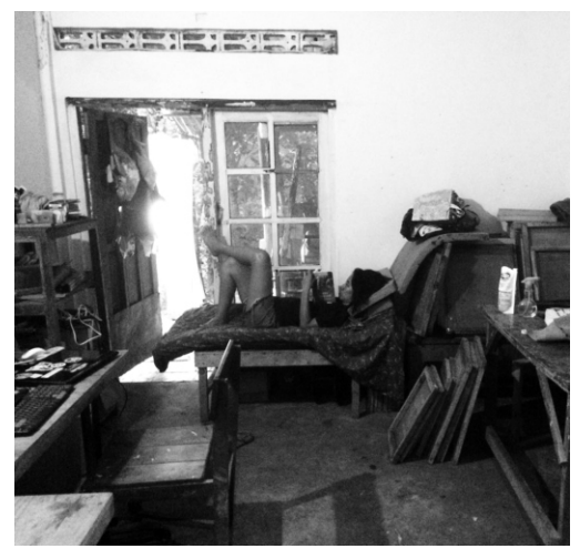
Recent screenprinting studio condition. Also function as place to rest and relax.